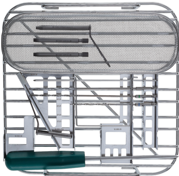
Set no. 19.035.001 - Level 1