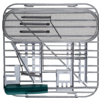
Set no. 19.035.001 - Level 1