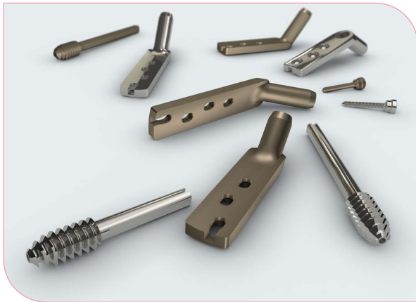
DHS screws, DHS compression screws, DHS flanges