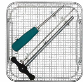
Set DHS/DCS removal