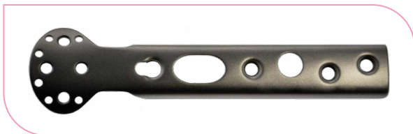
Supporting plate titanium