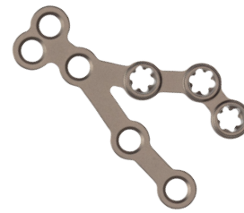
Item no. 5.8813.01