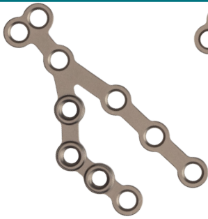
Item no. 5.878.01

for Screws \varnothing 3.5 mm and 4.0 mm; Titanium