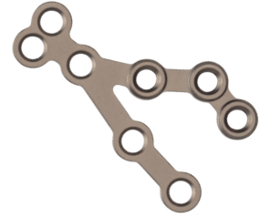
Item no. 5.881.01