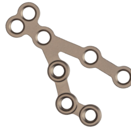
Item no. 5.880.01