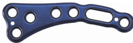
Art.-Nr. 5.3502.34, rechts